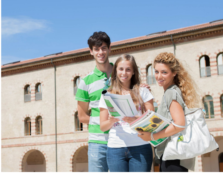
WITH THE SUPPORT OF THE ERASMUS MUNDUS PROGRAMME OF THE EUROPEAN UNION.

Structured UNiversity mobility between the Balkans and Europe for the Adriatic-ionian Macro-region.